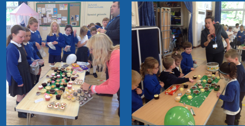
At St Mary's CVA in New Mills, class bubbles raised £157 for Macmillan