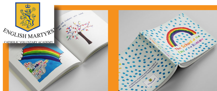
Pupils at English Martyrs' CVA in Long Eaton have published a book called 'The School at the End of the Rainbow.'