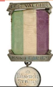
Medal awarded to Emmeline Pankhurst found at The Museum of London.