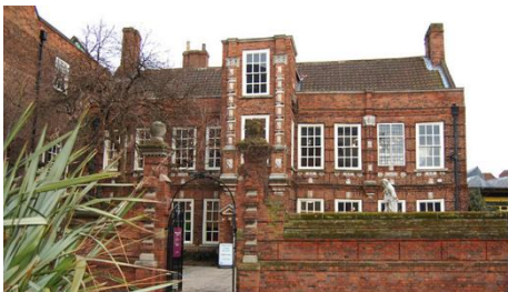
The William Wilberforce House Museum.

How do we know about these significant people? (Artefacts)